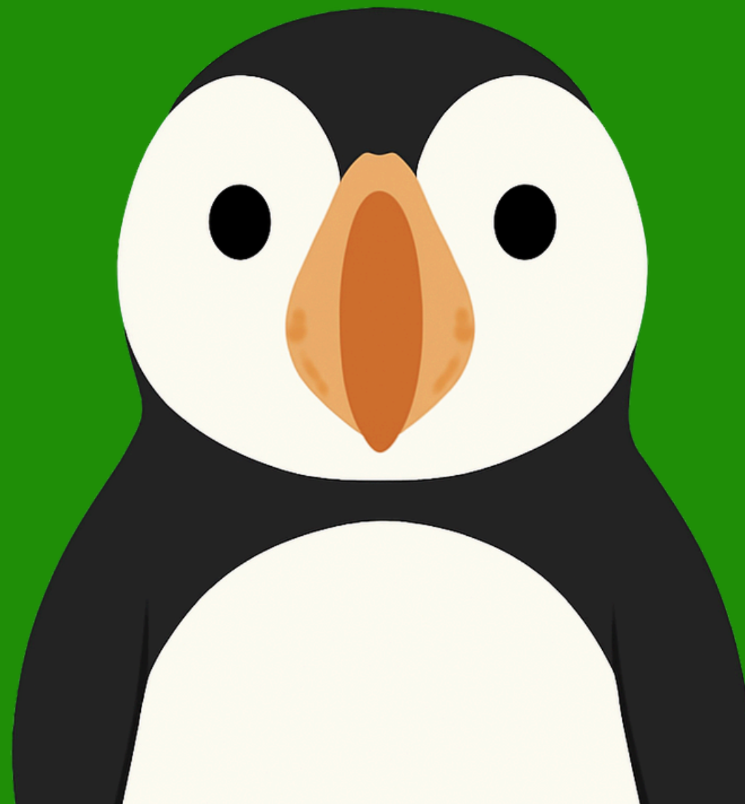
PENNY THE PUFFIN