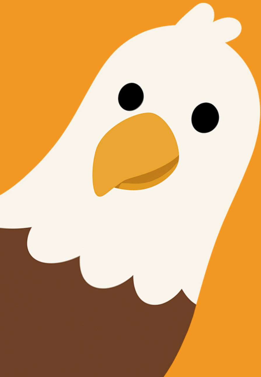
ELLA THE EAGLE